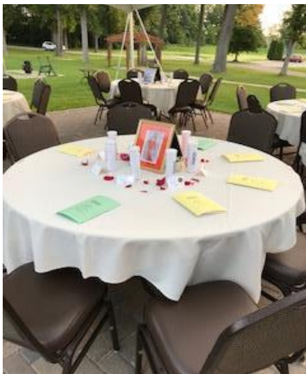
Under the “Big Tent” following COVID Guidelines